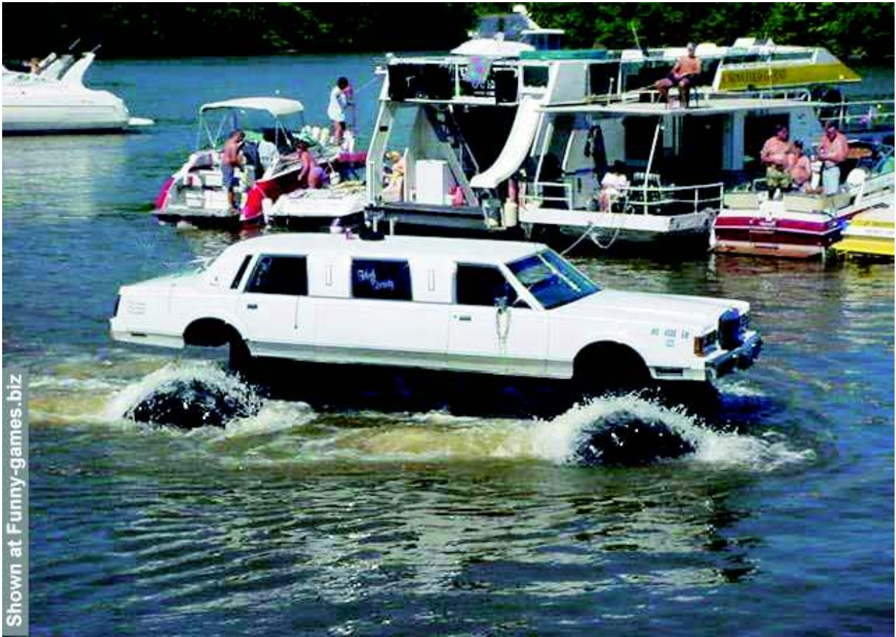
Shown at Funny-games.biz