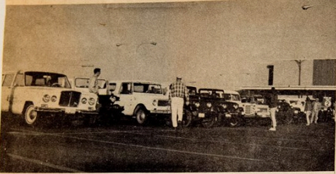
FOUR-WHEEL-DRIVE Club enthusiasts line up at 6:30 a.m. to start out on an all-day trip over Jeep trails.